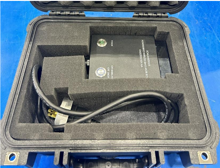
The Pelican case only contains foam and the simulation box which features an attached power cord.