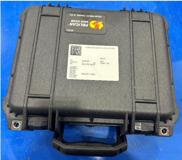
External view of Pelican case